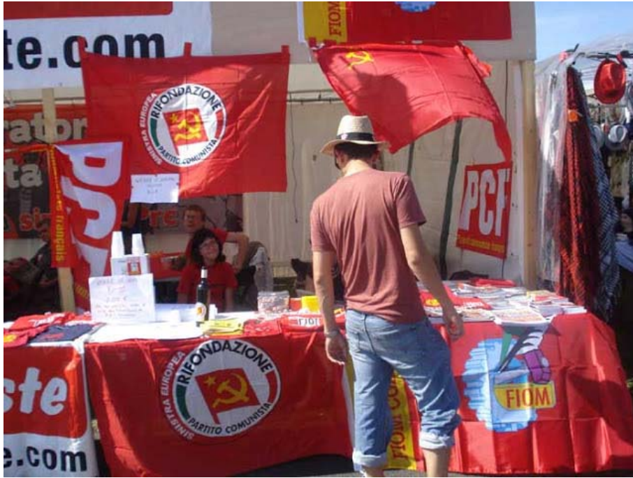
A stall at the Fête de l'Humanité